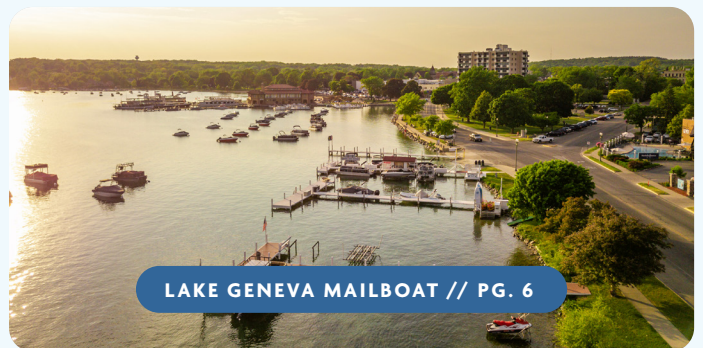
LAKE GENEVA MAILBOAT // PG. 6