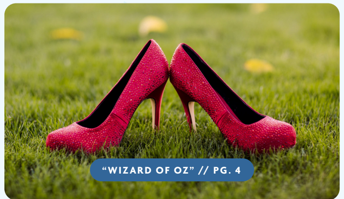
"WIZARD OF OZ" // PG. 4